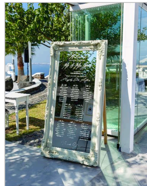
A very stylish table plan display